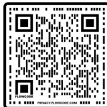
Scan to Register

Scan the QR Code below to register online